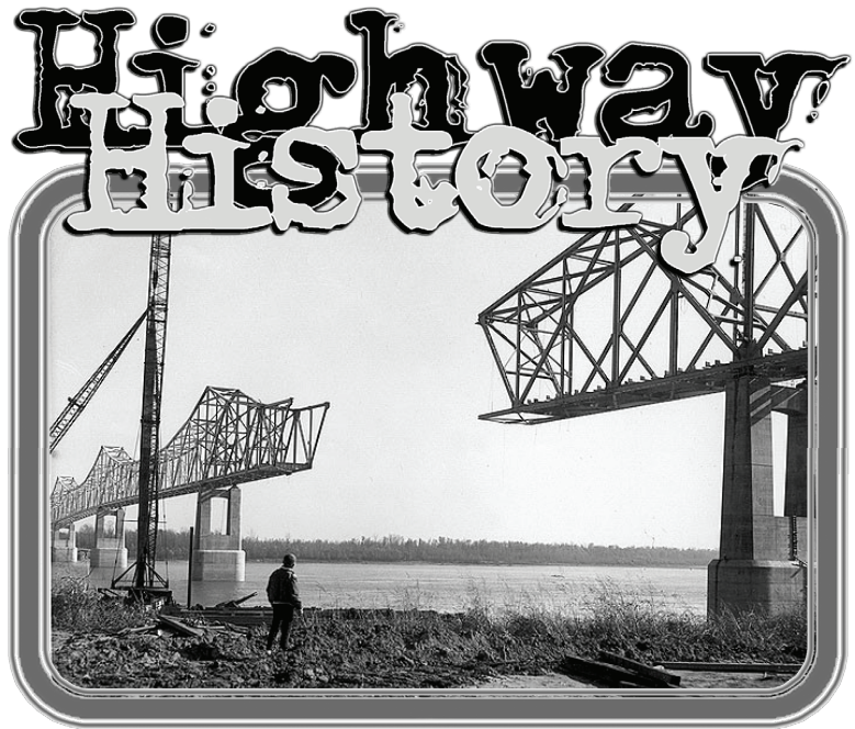
Construction of the Highway 49 Bridge over the Mississippi River in Helena. The bridge opened to traffic in July 1961. An average of 6,200 vehicles cross it daily.

Hobbies/Interests: Besides enjoying spending time with my family, I like carpentry work, landscaping and yard work. When I get the chance, I love to golf.